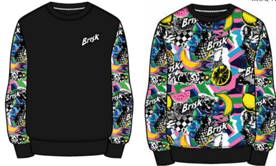
CUSTOM FLEECE HOODIE

This classic piece will be everywhere this fall and in a cold-weather-friendly fabric. The fleece crew neck will keep you warm and stylish all year long and can be customized to your liking.