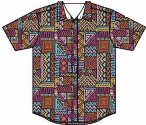
CAMP SHIRTS • BUCKETS

If you were a 90s kid you're going to love the return of 90s fashion, and no we aren't talking about those awful low rise jeans. The vibrant patterns of our youth are back and our camp tees and bucket hats are perfect for this trend!