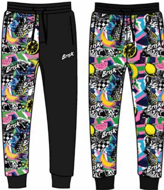
CUSTOM FLEECE JOGGERS

Jog into fall with our customized fleece joggers. Go crazy with tie-dye or go simple for an every-day wear. Either way, they'll keep you warm and be your most-worn piece in your closet.