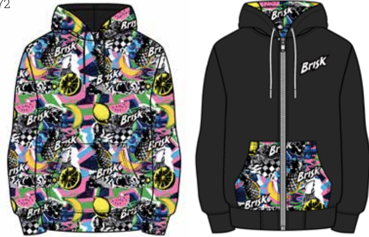
CUSTOM FLEECE HOODIES & FULL ZIPS

Rep your favorite team or brand in comfort with our custom fleece hoodies and full zips. With a front pocket and oversized fit, you'll wear these hoodies day in and day out.